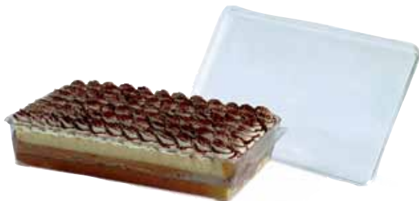
8074 TIRAMISU DISH WITH LID SMOKED