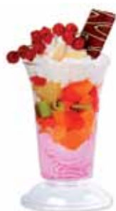
8003 PISA GEMINI