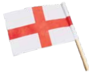
5202 ENGLISH FLAGS (ST. GEORGE CROSS) Pack 1000