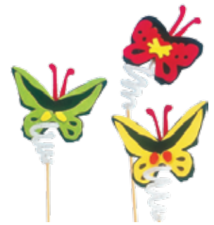
5122 BUTTERFLIES Pack 144