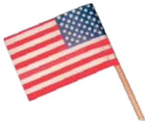
5102 AMERICAN FLAGS Pack 1000