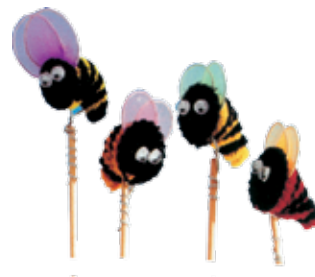
5004 BEE ON STICK Pack 100