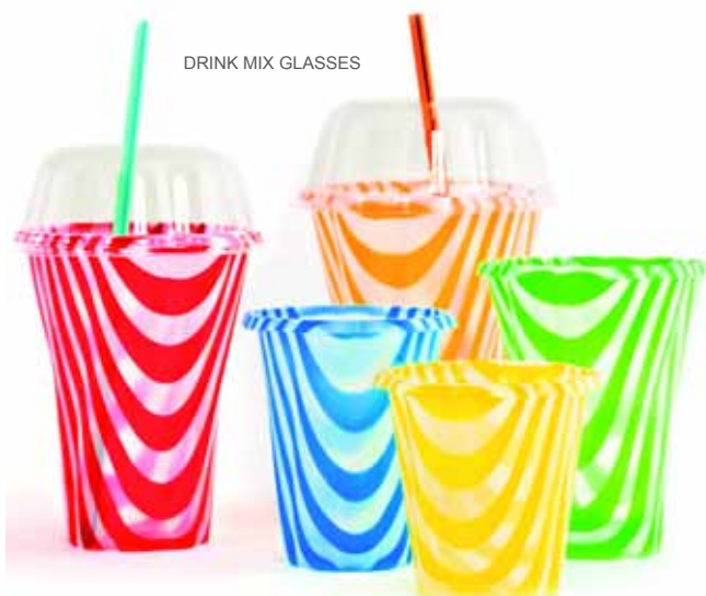
DRINK MIX GLASSES