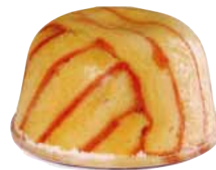
8030 CASSATA BOWL