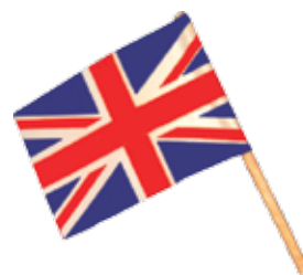
5000 UNION JACK FLAGS Pack 1000