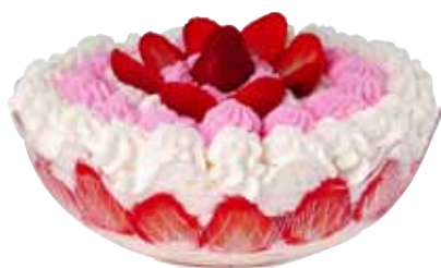
8063 TRIFLE BOWL