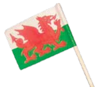
5001 WELSH FLAGS Pack 1000