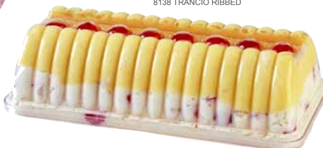
8138 TRANCIO RIBBED