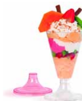
8050 FIRENZE SUZANNA