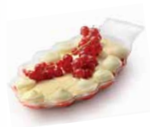
8106 LEAF OPAQUE

The above items are subject to VAT at the Standard Rate