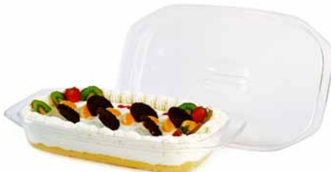
8081 TIRAMISU DISH WITH LID PRIMAVERA