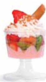
8006 VENEZIA MOROZZI