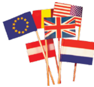
5117 ASSORTED FLAGS ON STICKS Pack 1000