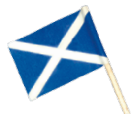
5101 SCOTTISH FLAGS Pack 1000