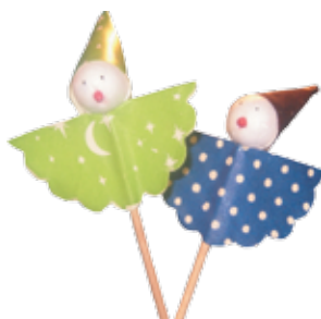
5006 SMALL CLOWNS Pack 50