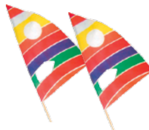
5007 SAILS Pack 50