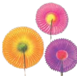
5005 SMALL SUNS Pack 50