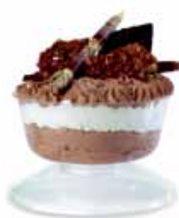
8002 MONZA STEFANIA