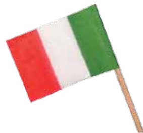
5002 ITALIAN FLAGS Pack 1000