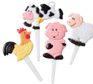
5016 FARM ANIMALS (PLASTIC) Pack 144