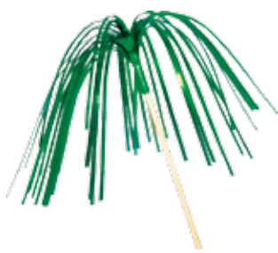
5008 CASCADE ON STICK Pack 144