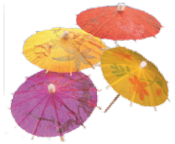
5112 FLORAL UMBRELLAS Pack 144