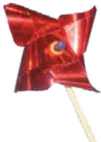
5012 FOIL WINDMILL ON STICK Pack 50